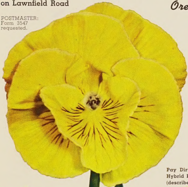
Pay Dirt Hybrid Pansy (described inside)

Sec. 34.66 P. L. & R. U. S. POSTAGE PAID Permit No. 1 CLACKAMAS, ORE.